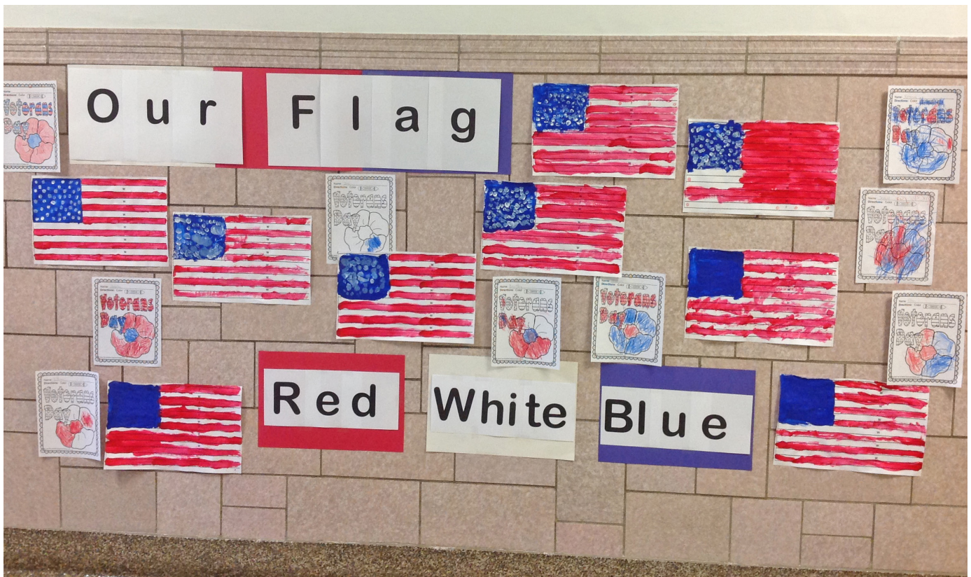
PreK learned about Veterans Day and our American Flag. Red, white and Blue!