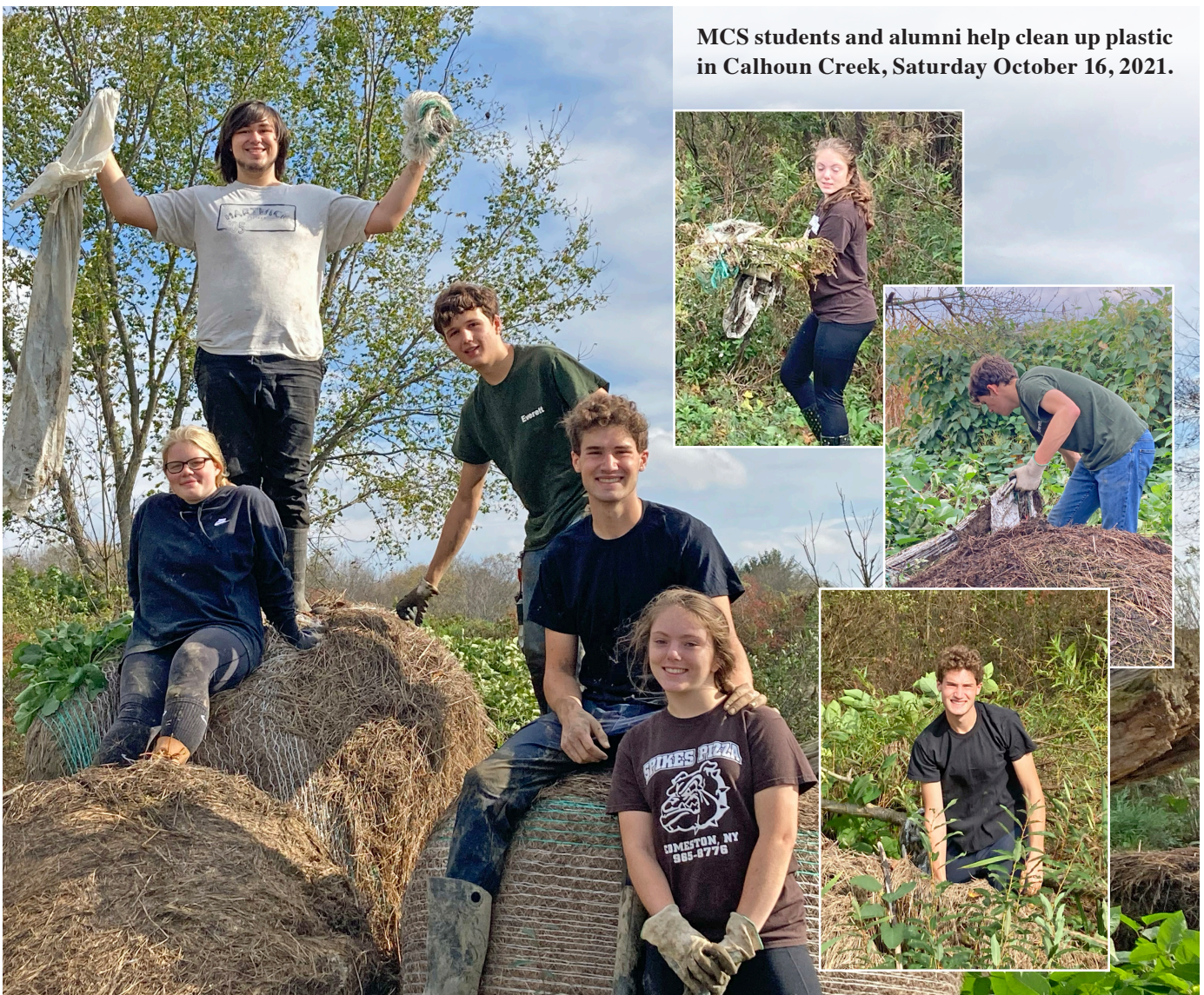
MCS students and alumni help clean up plastic in Calhoun Creek, Saturday October 16, 2021.